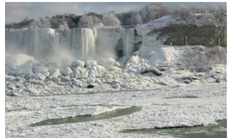
The American Falls in Winter